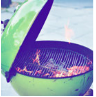
Operating a Grill Indoors or in Garage