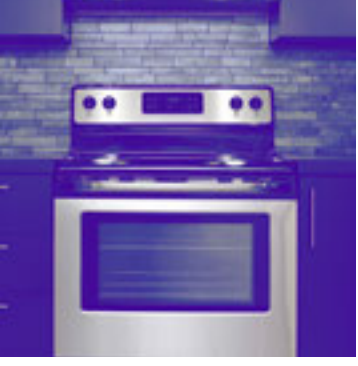
Improperly Installed Kitchen Range or Vent