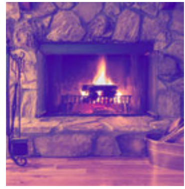
Gas or Wood-Burning Fireplace