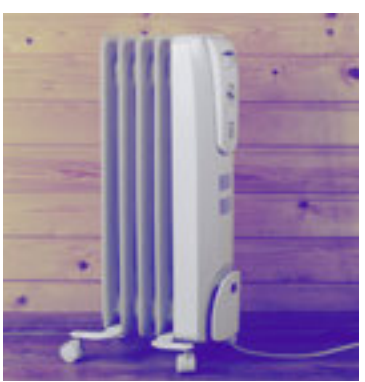
Portable Kerosene or Gas Heaters