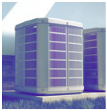
Loose or Broken Vent Pipes